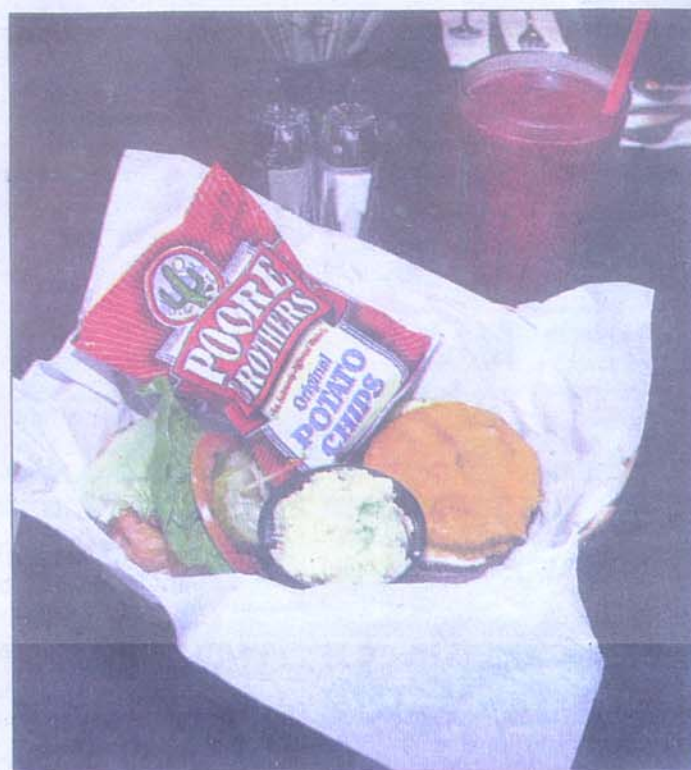
A Route 66 bacon cheeseburger, a vegetarian sandwich at Lovin' Spoonfuls, includes chips, potato salad, pickles, lettuce and tomato. Also shown is a Stella Blue Smoothie (top right).

tious. My companion said the faux pollo was well-marinated and